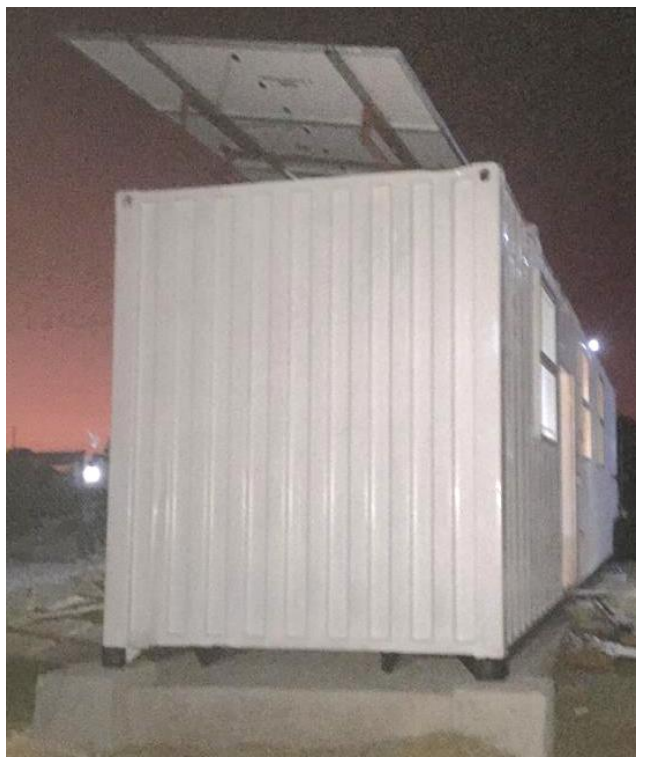
Combo Box Key Clients